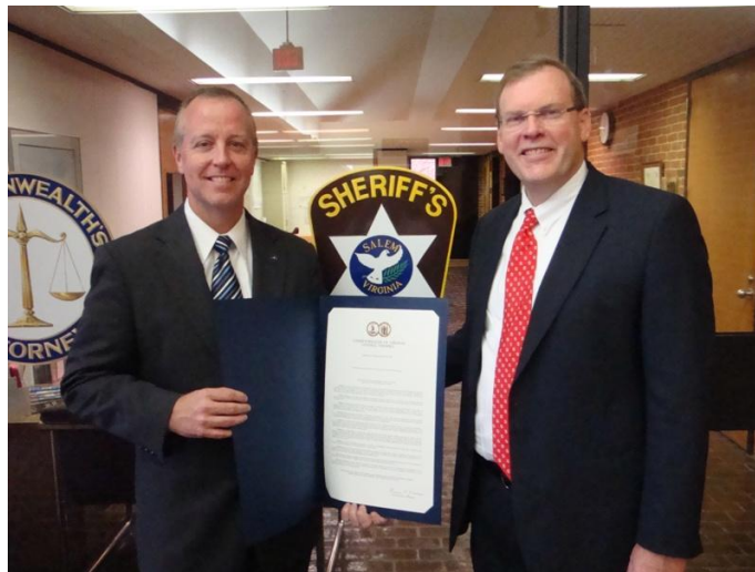
Then House Majority Leader (now US Congressman) Morgan Griffith presents Sheriff Atkins with a copy of the Order of Commemoration of the 375 th Anniversary of the Office of Sheriff. The document has been framed and is placed in the Courthouse Commons Area.

Skill development through training will continue to be the main focus for improving the capabilities of all members of the City of Salem Sheriff's Office. Already planned for 2011 are two training seminars; the first of which will feature historical and contemporary analysis of leadership and accountability. Regardless of circumstances, the Office under the direction of Sheriff Atkins is prepared to engage in any security/law enforcement mission placed upon it and is ready to serve the citizens of the City of Salem with confidence and zeal.