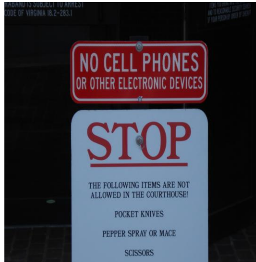
Sign posted in front of the Salem Courthouse

Salem, a thirty day advance public advisory of the cell-phone ban was placed on the governmental channel (Comcast 18) for the benefit of the public.