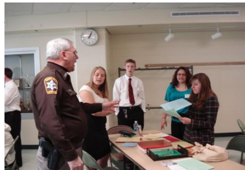
(L) Deputy Wood Details the equipment on her duty belt to kindergartners (R) Deputy Ferguson advises high school seniors on law enforcement issues during mock general assembly session.